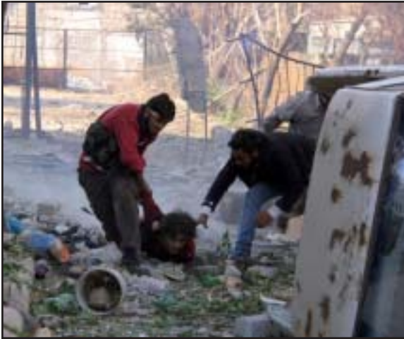
Syrian rebel fighters helping a comrade reach safety after he was shot in the leg by a sniper during a clash last week in the northern city of Aleppo.