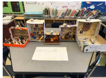
4 th grade students designed and built scale structures with lighting.